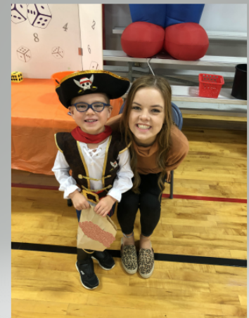
Permission obtained for use of photo

Written & submitted by Jaden Moffitt, CTE Intern